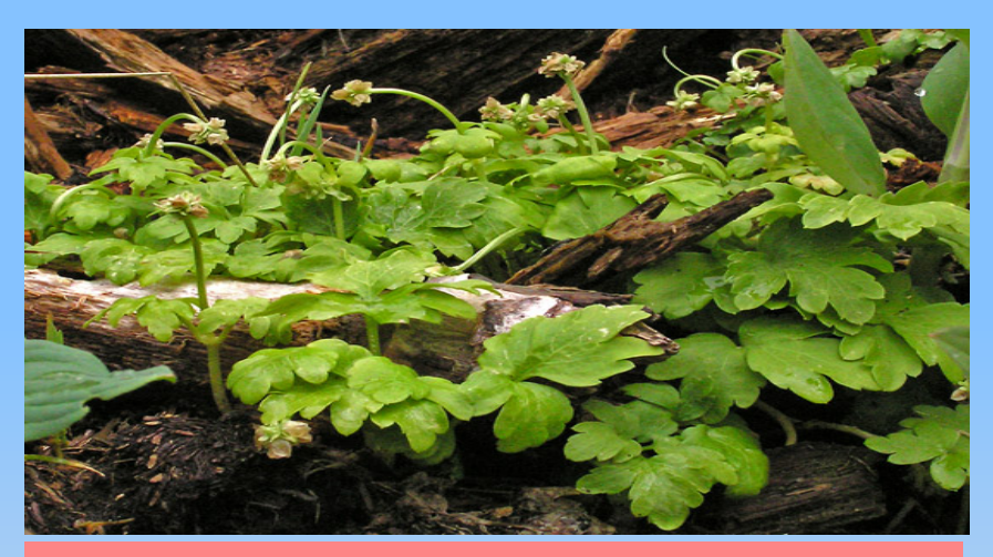
Indian Spikenard (Jatamamsi)